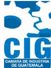
Guatemalan Chamber of Industry www.industriagate.com